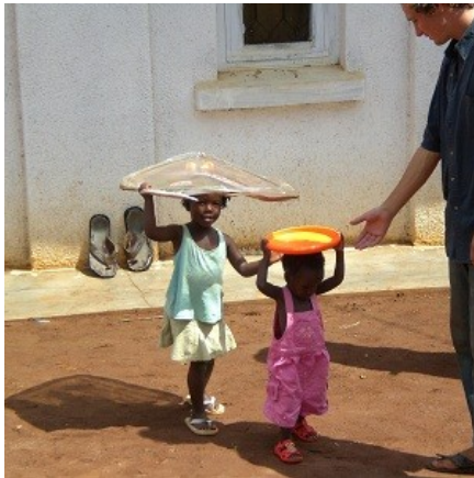
Sun is hot!

continue to entertain us with their smiles and antics. Just be careful when picking up the wet-bottomed ones.