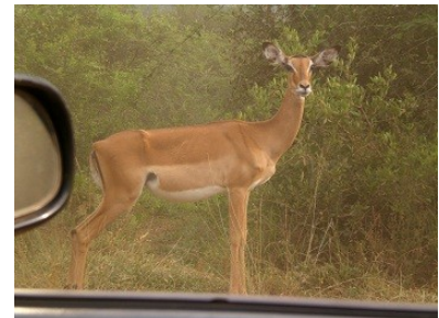
Gotta love DIY-safari...